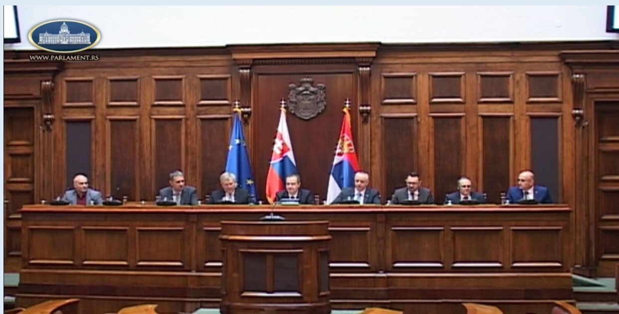
Video-opening of the conference